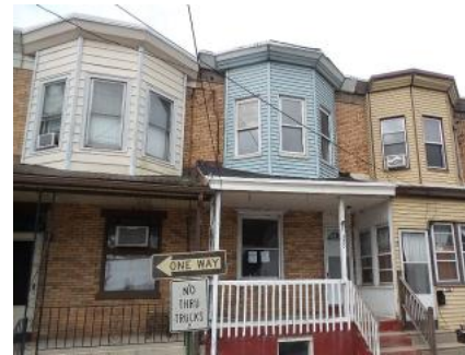
230 Warren St, Gloucester City, NJ 08030

Bedrooms: 2 Bathrooms: 1 Square Feet: 864 Year Built: 1993 FHA Case #: 351-324181 List Date: 10-17-17 Bid Deadline: 10-21-17 List Price: $29,000 Status: New Listing