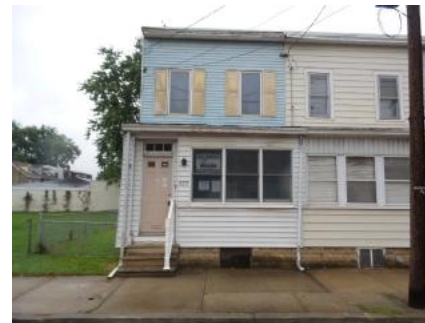
223 3rd St, Gloucester City, NJ 08030

Bedrooms: 3 Bathrooms: 2 Square Feet: 1,440 Year Built: 1925 FHA Case #: 351-570135 List Date: 10-13-17 Bid Deadline: 10-22-17 List Price: $37,000 Status: New Listing