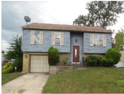
2457 Shelley Ln, Pennsauken, NJ 08109

Bedrooms: 3 Bathrooms: 1.1 Square Feet: 1,512 Year Built: 1975 FHA Case #: 351-503946 List Date: 9-26-17 Bid Deadline: Daily List Price: $106,200 Status: Price Reduction