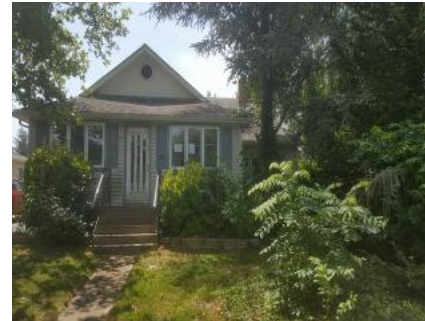
111 Rich Ave, Berlin, NJ 08009

Bedrooms: 3 Bathrooms: 2 Square Feet: 1,724 Year Built: 1956 FHA Case #: 351-543453 List Date: 10-17-17 Bid Deadline: 10-26-17 List Price: $247,000 Status: New Listing