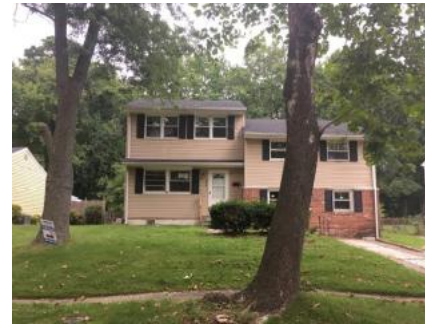
2009 Andrea Avenue, Lindenwold, NJ 08021

Bedrooms: 3 Bathrooms: 1.1 Square Feet: 1,512 Year Built: 1975 FHA Case #: 351-503946 List Date: 9-26-17 Bid Deadline: Daily List Price: $106,200 Status: Price Reduction