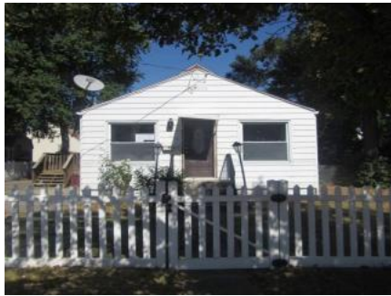
305 Station Ave, Glendora, NJ 08029

Bedrooms: 2 Bathrooms: 1 Square Feet: 1,388 Year Built: 1940 FHA Case #: 351-471832 List Date: 10-4-17 Bid Deadline: Daily List Price: $51,000 Status: New Listing