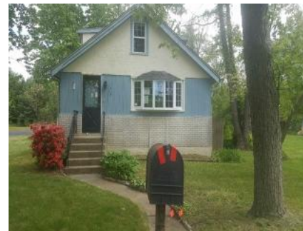
1328 Spruce Ave, Voorhees, NJ 08043

Bedrooms: 3 Bathrooms: 2 Square Feet: 2,032 Year Built: 1970 FHA Case #: 351-600629 List Date: 10-16-17 Bid Deadline: 10-25-17 List Price: $95,000 Status: New Listing