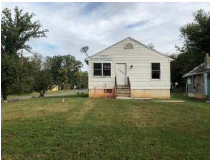
102 New Jersey Ave, Atco, NJ 08004

Bedrooms: 3 Bathrooms: 2 Square Feet: 1,340 Year Built: 1900 FHA Case #: 351-497253 List Date: 10-20-17 Bid Deadline: Daily List Price: $32,966 Status: Price Reduction