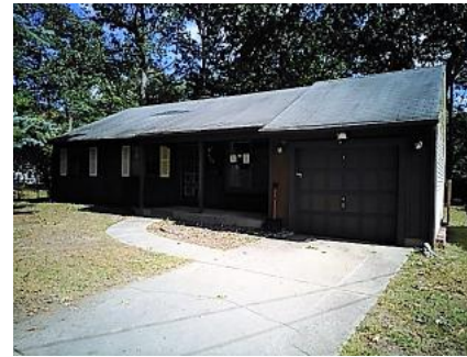
505 Bilper Ave, Lindenwold, NJ 08021

Bedrooms: 2 Bathrooms: 1 Square Feet: 1,388 Year Built: 1940 FHA Case #: 351-471832 List Date: 10-4-17 Bid Deadline: Daily List Price: $51,000 Status: New Listing