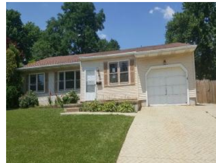
17 Grant Dr, Clementon, NJ 08021

Bedrooms: 3 Bathrooms: 2.1 Square Feet: 1,760 Year Built: 2004 FHA Case #: 351-463255 List Date: 10-12-17 Bid Deadline: 10-21-17 List Price: $133,000 Status: New Listing