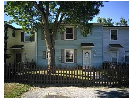
11 Berkshire Rd, Sicklerville, NJ 08081

Bedrooms: 2 Bathrooms: 1 Square Feet: 777 Year Built: 1952 FHA Case #: 351-487028 List Date: 10-20-17 Bid Deadline: 10-29-17 List Price: $46,000 Status: New Listing