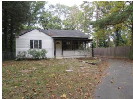
207 Woodland Avenue, Blackwood, NJ 08012

Bedrooms: 3 Bathrooms: 1 Square Feet: 1,120 Year Built: 1977 FHA Case #: 351-350087 List Date: 10-6-17 Bid Deadline: Daily List Price: $50,000 Status: New Listing