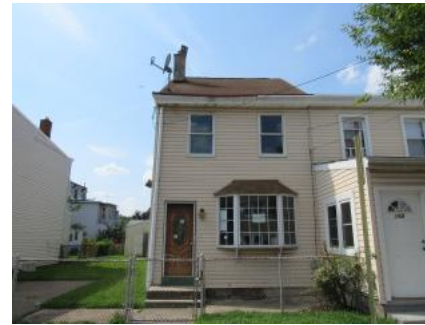
171 S Burlington St, Gloucester City, NJ 08030

Bedrooms: 2 Bathrooms: 1 Square Feet: 988 Year Built: 1955 FHA Case #: 351-431914 List Date: 10-20-17 Bid Deadline: 10-29-17 List Price: $34,000 Status: New Listing