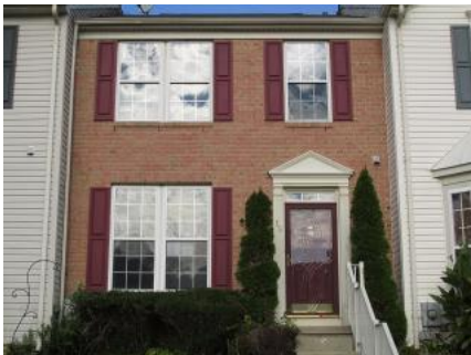
12 Bridle Path Ct, Sicklerville, NJ 08081

Bedrooms: 3 Bathrooms: 3.1 Square Feet: 3,115 Year Built: 1960 FHA Case #: 351-335073 List Date: 9-26-17 Bid Deadline: Daily List Price: $155,664 Status: Price Reduction