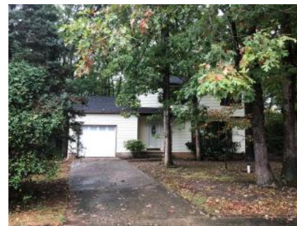
6 Villa Cir, Berlin, NJ 08009

Bedrooms: 6 Bathrooms: 3 Square Feet: 2,128 Year Built: 1950 FHA Case #: 351-478218 List Date: 10-19-17 Bid Deadline: Daily List Price: $118,098 Status: Relist