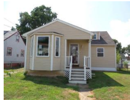
242 Union Ave, Bellmawr, NJ 08031

Bedrooms: 4 Bathrooms: 2.1 Square Feet: 1,904 Year Built: 1973 FHA Case #: 351-478155 List Date: 9-18-17 Bid Deadline: Daily List Price: $100,000 Status: New Listing