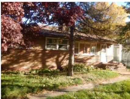
2634 Powell Ave, Pennsauken, NJ 08110

Bedrooms: 3 Bathrooms: 1.5 Square Feet: 1,437 Year Built: 1969 FHA Case #: 351-492264 List Date: 10-19-17 Bid Deadline: Daily List Price: $119,232 Status: Relist