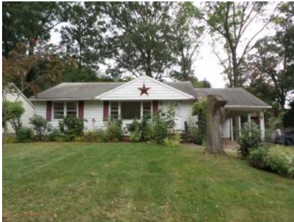
434 Coles Mill Road, Haddonfield, NJ 08033

Bedrooms: 3 Bathrooms: 2 Square Feet: 1,724 Year Built: 1956 FHA Case #: 351-543453 List Date: 10-17-17 Bid Deadline: 10-26-17 List Price: $247,000 Status: New Listing