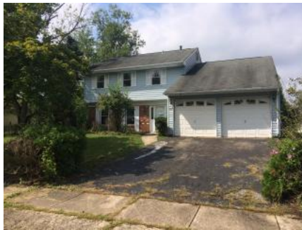
152 Arbor Meadow Dr, Sicklerville, NJ 08081

Bedrooms: 5 Bathrooms: 3 Square Feet: 2,524 Year Built: 1965 FHA Case #: 351-497572 List Date: 10-18-17 Bid Deadline: Daily List Price: $104,361 Status: Relist