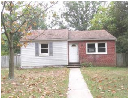
52 East 9th Ave, Pine Hill, NJ 08021

Bedrooms: 2 Bathrooms: 1 Square Feet: 988 Year Built: 1955 FHA Case #: 351-431914 List Date: 10-20-17 Bid Deadline: 10-29-17 List Price: $34,000 Status: New Listing