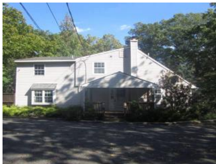
20 Tomlinson Ave, Clementon, NJ 08021

Bedrooms: 3 Bathrooms: 1 Square Feet: 1,456 Year Built: 1960 FHA Case #: 351-387665 List Date: 10-11-17 Bid Deadline: Daily List Price: $95,220 Status: Price Reduction