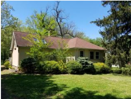
1404 Oxmead Rd, Burlington, NJ 08016

Bedrooms: 3 Bathrooms: 3 Square Feet: 2,281 Year Built: 1945 FHA Case #: 351-554457 List Date: 10-20-17 Bid Deadline: Daily List Price: $153,000 Status: Relist