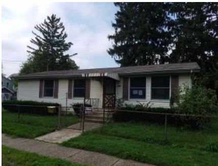
308 Ellis Street, Burlington, NJ 08016

Bedrooms: 3 Bathrooms: 1 Square Feet: 1,260 Year Built: 1955 FHA Case #: 351-591078 List Date: 10-13-17 Bid Deadline: 10-22-17 List Price: $76,000 Status: New Listing