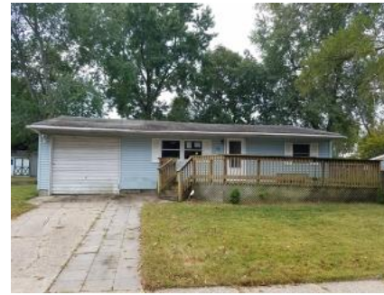
50 Indian Queen Ln, Maple Shade, NJ 08052

Bedrooms: 2 Bathrooms: 1.1 Square Feet: 1,312 Year Built: 1890 FHA Case #: 351-496156 List Date: 9-29-17 Bid Deadline: Daily List Price: $77,280 Status: Price Reduction