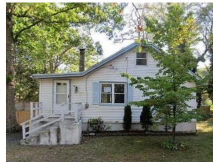
29 Orchard Avenue, Browns Mills, NJ 08015

Bedrooms: 2 Bathrooms: 1 Square Feet: 1,122 Year Built: 1938 FHA Case #: 351-507805 List Date: 10-12-17 Bid Deadline: Daily List Price: $82,800 Status: Relist