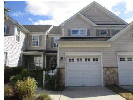
234 Starboard Way, Mount Laurel, NJ 08054

Bedrooms: 3 Bathrooms: 3 Square Feet: 2,281 Year Built: 1945 FHA Case #: 351-554457 List Date: 10-20-17 Bid Deadline: Daily List Price: $153,000 Status: Relist