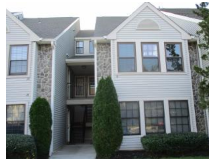
19 Provincetown Dr Unit 19, Marlton, NJ 08053

Bedrooms: 2 Bathrooms: 1 Square Feet: 1,068 Year Built: 1910 FHA Case #: 351-499175 List Date: 10-10-17 Bid Deadline: Daily List Price: $114,000 Status: New Listing