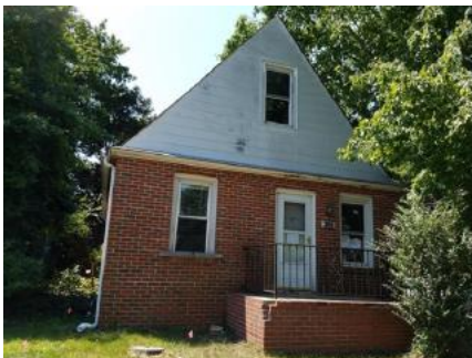
300 Mill St, Mount Holly, NJ 08060

Bedrooms: 2 Bathrooms: 2 Square Feet: 1,112 Year Built: 1987 FHA Case #: 351-487588 List Date: 10-5-17 Bid Deadline: Daily List Price: $87,000 Status: New Listing