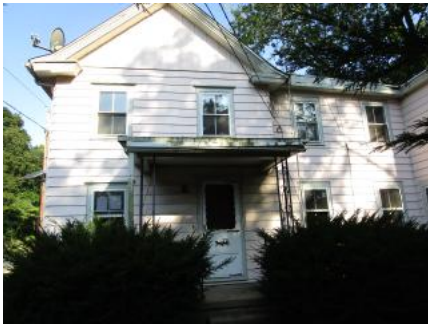
468 Landing Street, Lumberton, NJ 08048

Bedrooms: 2 Bathrooms: 1.1 Square Feet: 1,312 Year Built: 1890 FHA Case #: 351-496156 List Date: 9-29-17 Bid Deadline: Daily List Price: $77,280 Status: Price Reduction